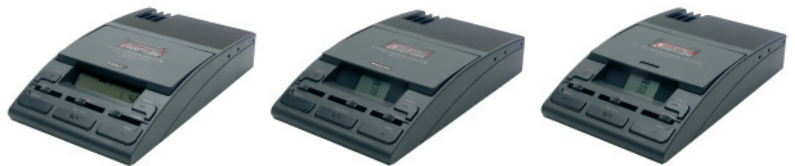
Transcription/Dictation Kit analog