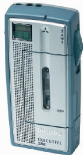
Pocket Memo Analog 588