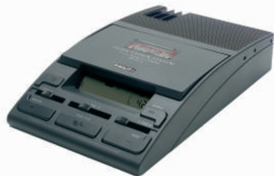
Analog Transcription / Dictation Kit 730 executive