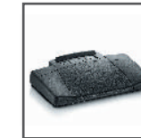
Foot Control 2210