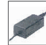
Power Supply 155