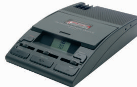
Analog Transcription Kit 720 executive