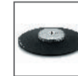
Conference Microphone 9172