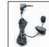
Tie Clip Microphone 9173