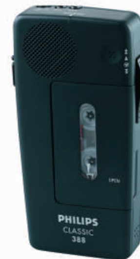
Pocket Memo Analog 388