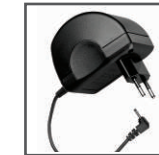
Power Supply 142