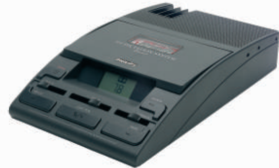
Analog Dictation Kit 725 executive