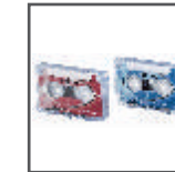
Mini Cassette 005 / 007