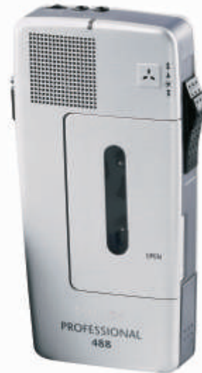
Pocket Memo Analog 488