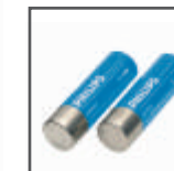
Rechargeable Batteries 153