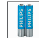
Rechargeable Batteries 9154