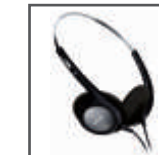
Stereo Headphone 2236